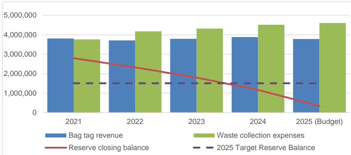
Figure 2: Historical Performance of Bag Tag Program

The County-wide bag tag program was originally established by County Council through the enactment of By-law 4257-2002 to offset tax levy contributions and promote waste diversion through increased recycling. Bag tag fees exclusively fund the annual operating costs for curbside garbage collection and disposal. Table 2 provides a detailed break-down on various Waste Management Activities.