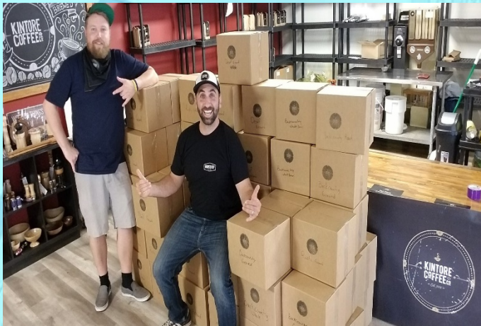
Kintore Coffee Co. - Embro