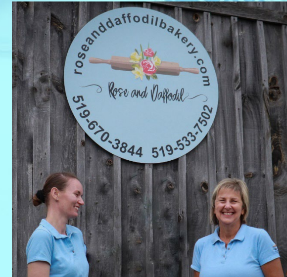
Rose & Daffodil Bakery - Tillsonburg