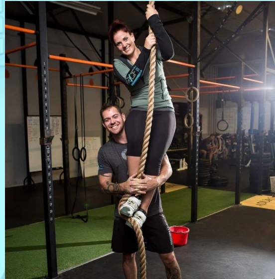
Aduro Athletics - Woodstock