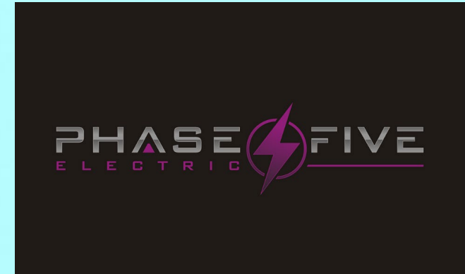
Phase Five Electric - Ingersoll