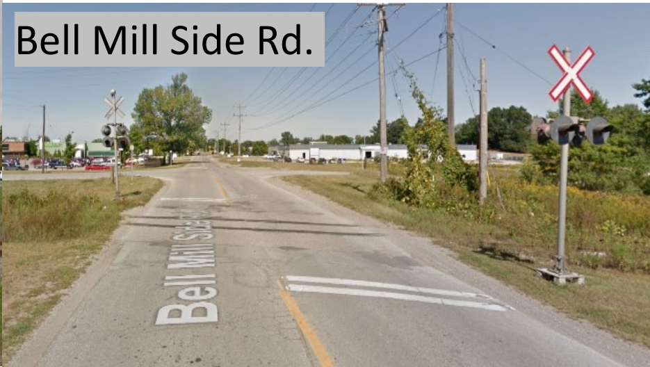
Bell Mill Side Rd.