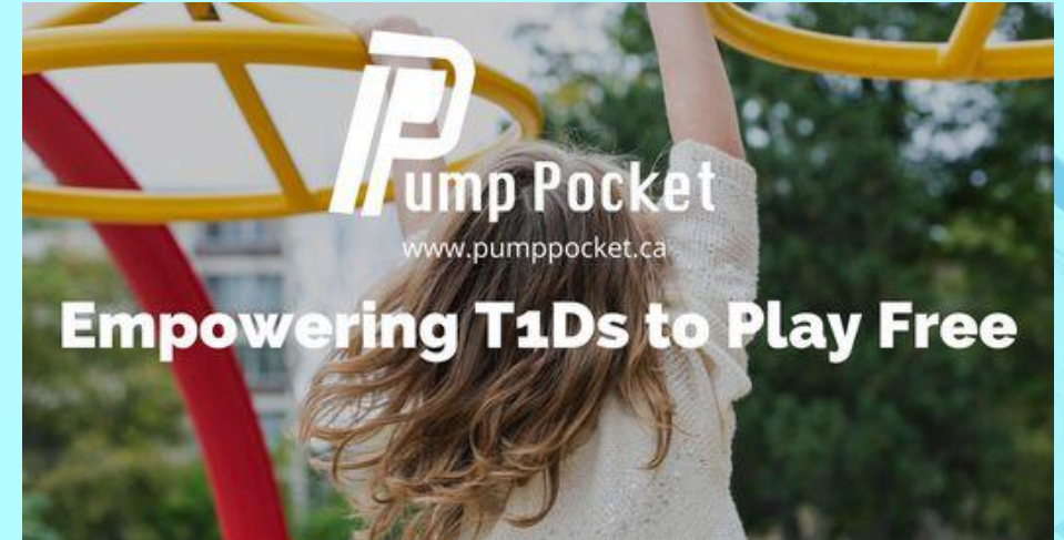
Pump Pocket - Ingersoll