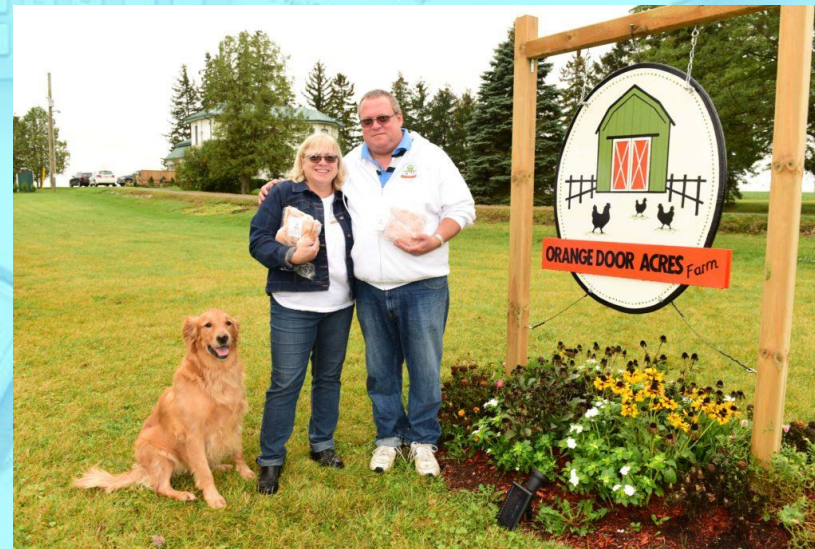
Orange Door Acres – Mt. Elgin