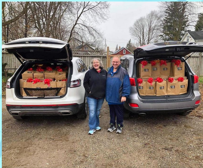
Poppin Kettle Corn - Norwich