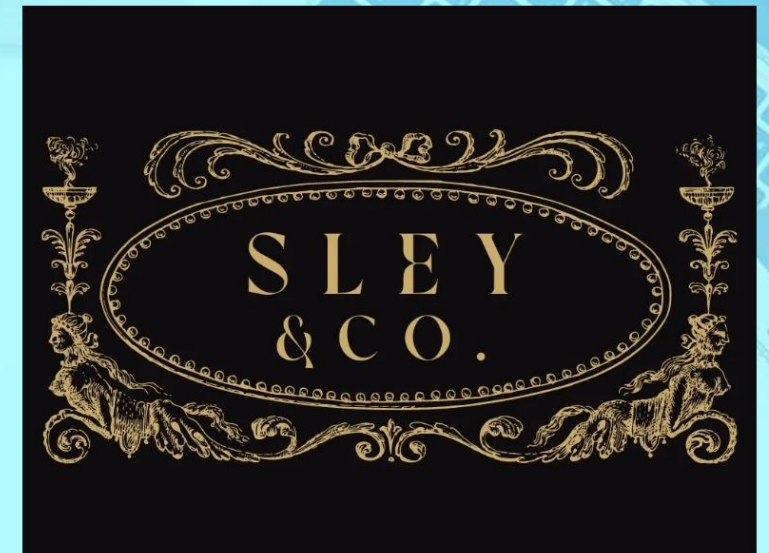
SLEY & Co. - Woodstock